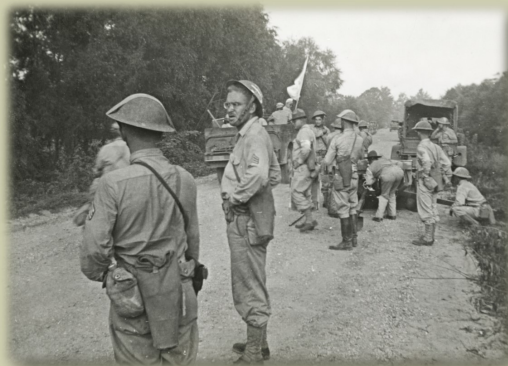
Soldiers from one of the 27th ID's field artillery regiments set up a towed artillery gun during the Tennessee Maneuvers, June 1941.