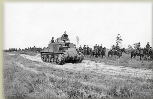
An M3 Lee Medium Tank crew drives past a company of mounted cavalrymen during the Louisiana-Arkansas Maneuvers, 1941.