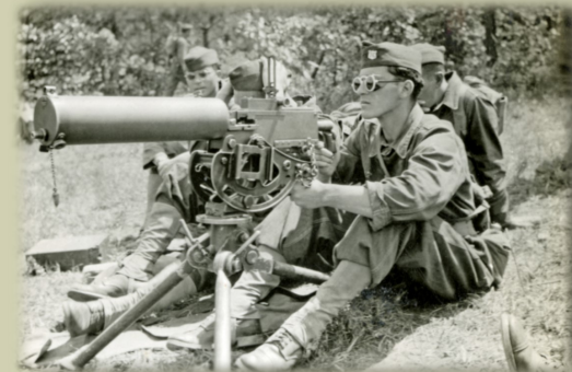
A machine gun company of the 27th ID prepares to fire an M1917 Browning,.30 caliber machine gun during basic training at Fort McClellan, Alabama, 1940-1941.

tactics on a large scale. In one exercise, during the Tennessee Maneuvers, Major General George Patton's 2nd Armored Division pushed back conventionally-armed defenders but failed to achieve a spectacular victory. Also, the maneuvers revealed reconnaissance and troop supply problems that had to be fixed.