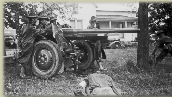
Soldiers from a 27th ID field artillery regiment practice with an M1897 75mm towed gun, Fort McClellan, Alabama, 1940.